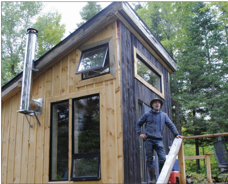
Durand stands at the top of the steps leading up to his short-term rental business' newest addition, the "Stargate 1" cabin, which people can rent for an off-grid, dark sky, nature-heavy getaway.