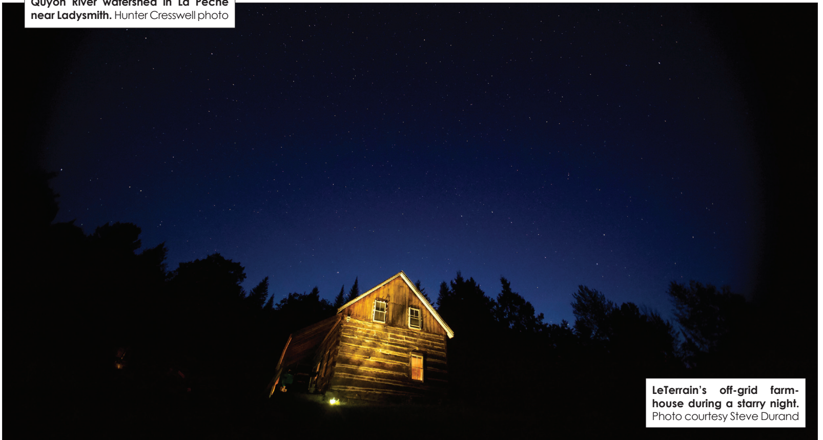
LeTerrain's off-grid farmhouse during a starry night.

Accommodations range from $150 to $250 per night, visit leterrain.land for more information.