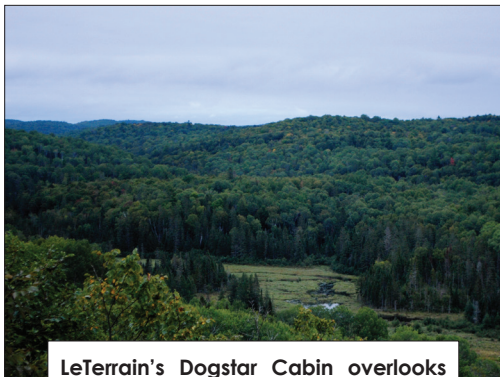
LeTerrain's Dogstar Cabin overlooks the very northeastern corner of the Guyon River watershed in La Pêche near Ladysmith.